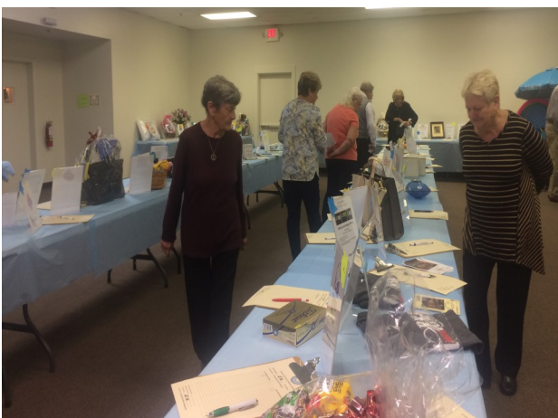
Browsers in the Auction Room try to decide which items to bid on