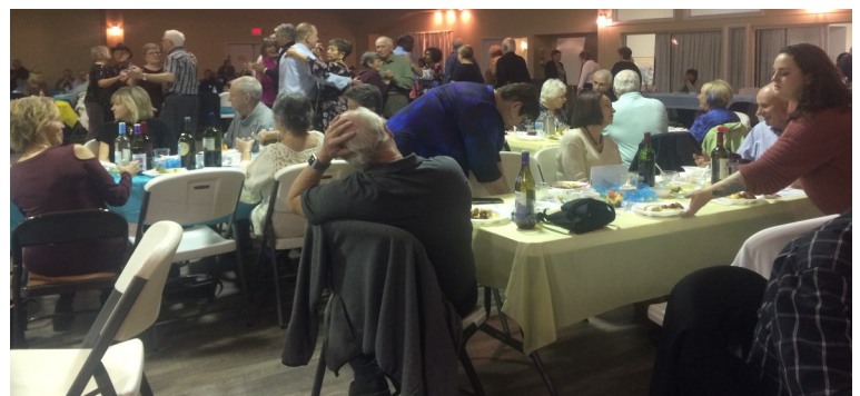
Diners enjoy dinner being served.