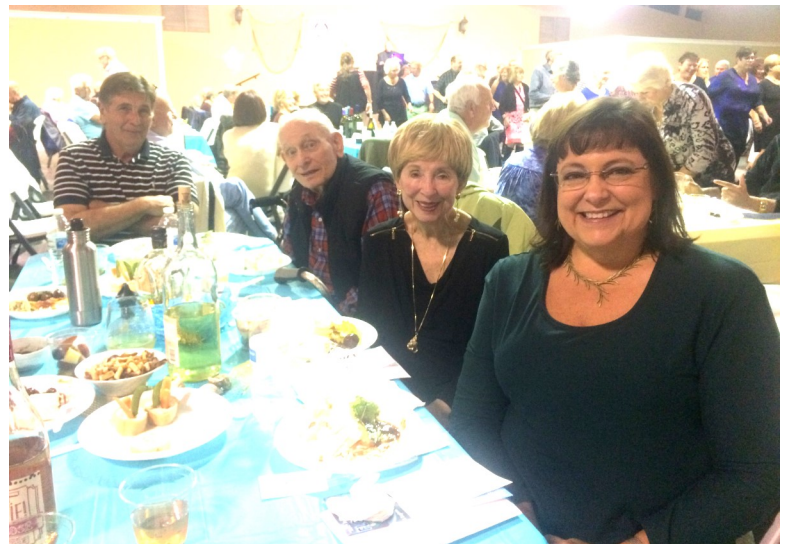
The Quave family is having a delightful time.